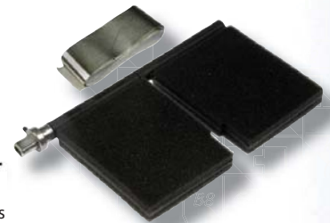
902-320 Grand Cherokee 2004-99 Installed Through Dashboard Area

Includes installation instructions and metal tape to close box after installation