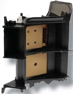
902-307 Grand Cherokee 2004-88 Installed through Glove Box Area

Reduce Repair Cost: Replace Just the Failed Blend Door Instead of the Entire Plenum