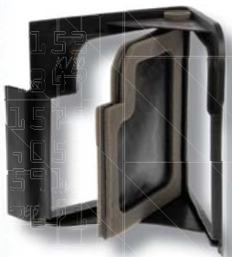
902-203 E Series Vans 2009-97