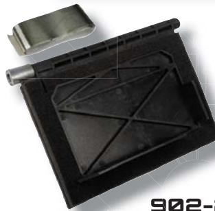
902-221 Explorer, Mazda Pick-up, Mountaineer, Navajo, Ranger 2011-91