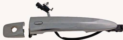
Exterior Door Handle Front Left RFID with Passive Entry 81396

Nissan Leaf 2013-11, Nissan Maxima 2015-09, Nissan Murano 2014-08, Nissan Sentra 2015-13