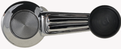
Window Handle 76912