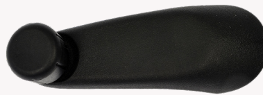
Window Crank Handle 775-5603

Cadillac 2011-07, Chevrolet 2014-07, GMC 2014-07