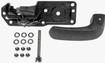
Interior Door Handle 80374

Cadillac 2011-07, Chevrolet 2014-07, GMC 2014-07