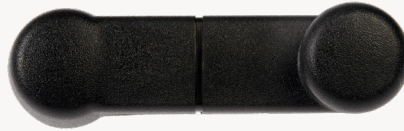
Window Handle 76946