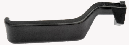
Interior Door Handle 77178