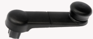
Window Handle Front Rear Left Right 767MXCD

General Motors 2020, General Motors 2018-95, Isuzu 2008-05