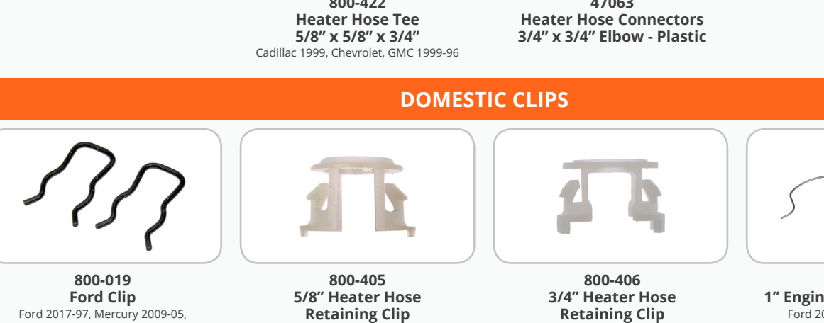
Retaining Clip Chevrolet Astro, GMC Safari 1995-90