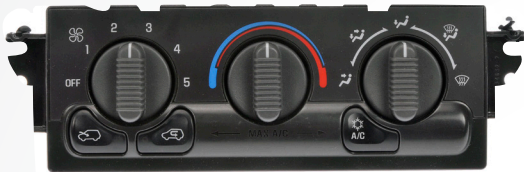
599-266 Cadillac 2002, Chevrolet 2002-99, GMC 2002-99

Over 60 SKUs covering over 75 million vehicles