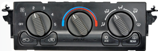
599-193 Chevrolet 2002-99, GMC 2002-99