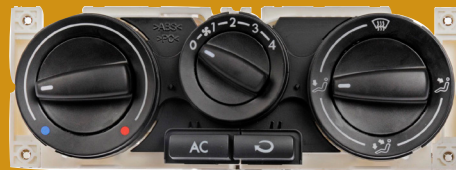
599-152 Volkswagen 2010-97