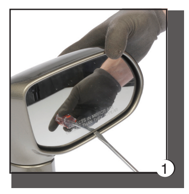
Fig. 1. Removing the broken mirror glass assembly from the current housing.

NOTE: It is important to review your Plastic-Backed Mirror Glass Assembly prior to beginning any installation ~ Specific tab or mount locations can vary by product.