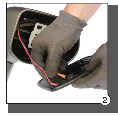
Fig. 2. Reconnecting the mirror glass assembly.

A. If vehicle has a heated mirror, connect the wires to the heater terminals.