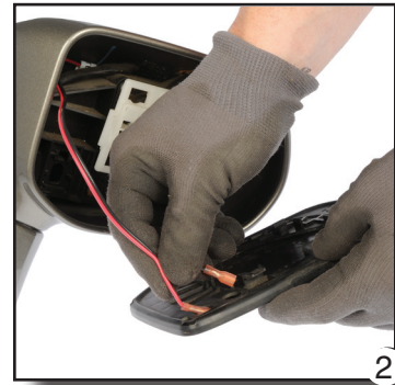
Fig. 2. Reconnecting the mirror glass assembly. A. If vehicle has a heated mirror, connect the wires to the heater terminals.