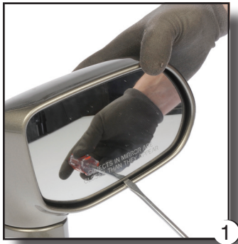
Fig. 1. Removing the broken mirror glass assembly from the current housing.

NOTE: It is important to review your Plastic-Backed Mirror Glass Assembly prior to beginning any installation ~ Specific tab or mount locations can vary by product.