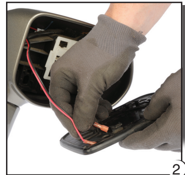
Fig. 2. Reconnecting the mirror glass assembly.