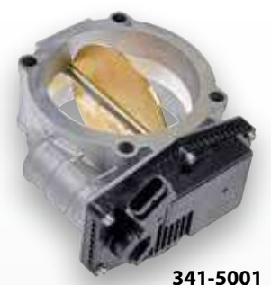
Detroit Diesel Series 60, 16, 15, 13 Engines 2015-87

Sprinter, Freightliner, Jeep, Mercedes 3.0L Diesel 2015-05