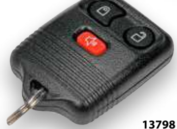
Ford Trucks and SUVs 2013-98