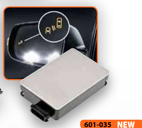
Chrysler 300, Durango, Town and Country 2013-11