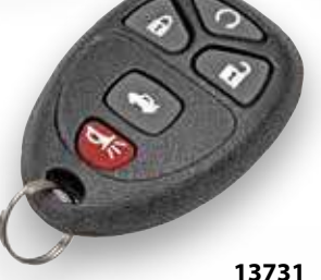
Buick, Chevrolet, Pontiac, Saturn Sedans 2012-04