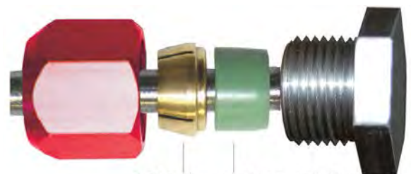
Self-Adjusting, Anti-Vibration Tension Ring -- Resists VibrationLeaks Seal Sleeve -- Up to 8 Times More Seal Surface Area than an O-ring