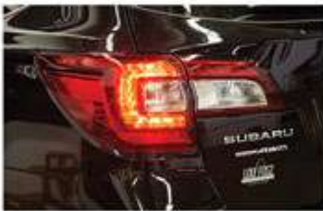
Turn Signal with Module Installed