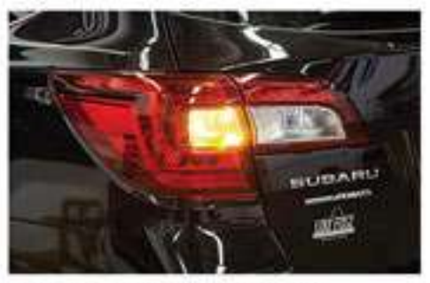
Factory Incandescent Turn Signal