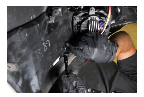
10. Reinstall the fog light bezel in the bumper, ensuring the tabs snap into place. Replace the original six screws to secure the bezel.