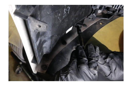
3. Looking at the fog light bezel, unplug the factory turn signal, sidemarker, and fog light connectors by depressing and pulling straight back. Then remove the six 7mm screws holding the fog light bezel in place.