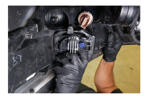
4. Press outward on the tabs holding the fog light bezel in place to separate it from the bumper. Once the bezel has been removed, take it to a working area with a soft surface.