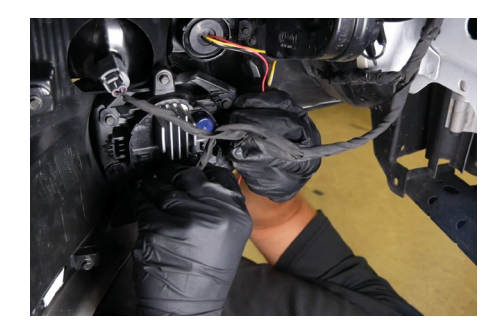
11. Plug the connector on the turn signal housing into the factory turn signal connector. Then reconnect the sidemarker and fog light connectors.