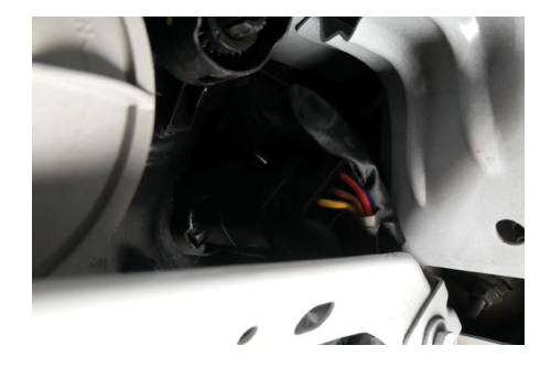
12. Unplug the headlight connector by depressing and pulling straight out. Plug the DRL wiring harness in line between the headlight and headlight connector.