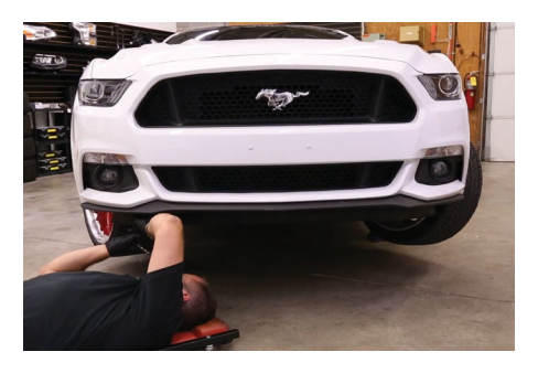
2. Remove the belly pan from underneath the vehicle. To do so, remove the 12 7mm screws on the outside edge, four 7mm screws on the belly pan itself, and six plastic rivets on the outside edge to remove the belly pan.