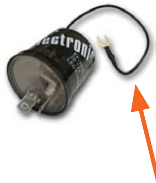
Black wire must be grounded

When using a stock bi-metal flasher, it is recommended that a standard duty flasher be used instead of a heavy duty flasher. If your turn signal circuit includes LED turn signals in the front as well as the rear, the turn signal circuit will not have enough resistance load to operate an original bi-metal flasher and this no-load flasher will be required for both the turn signal and hazard flashers.