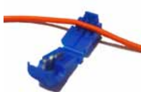
Insert wire onto T-Tap

The last page is a wire diagram of how the LED harness splices into the car's original harness.