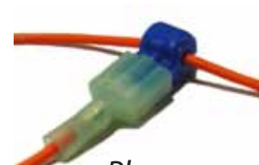
Plug connector into T-Tap

To keep the wires neatly tucked and in line, take the spliced sections and fold them over to one side and tape them in place. This will allow you to place the wiring into loom or have the ability to wrap the LED harness wiring tightly away.