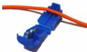
Insert wire onto T-Tap

The last page is a wire diagram of how the LED harness splices into the car's original harness.