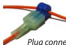
Plug connector into T-Tap

To keep the wires neatly tucked and in line, take the spliced sections and fold them over to one side and tape them in place. This will allow you to place the wiring into loom or have the ability to wrap the LED harness wiring tightly away.