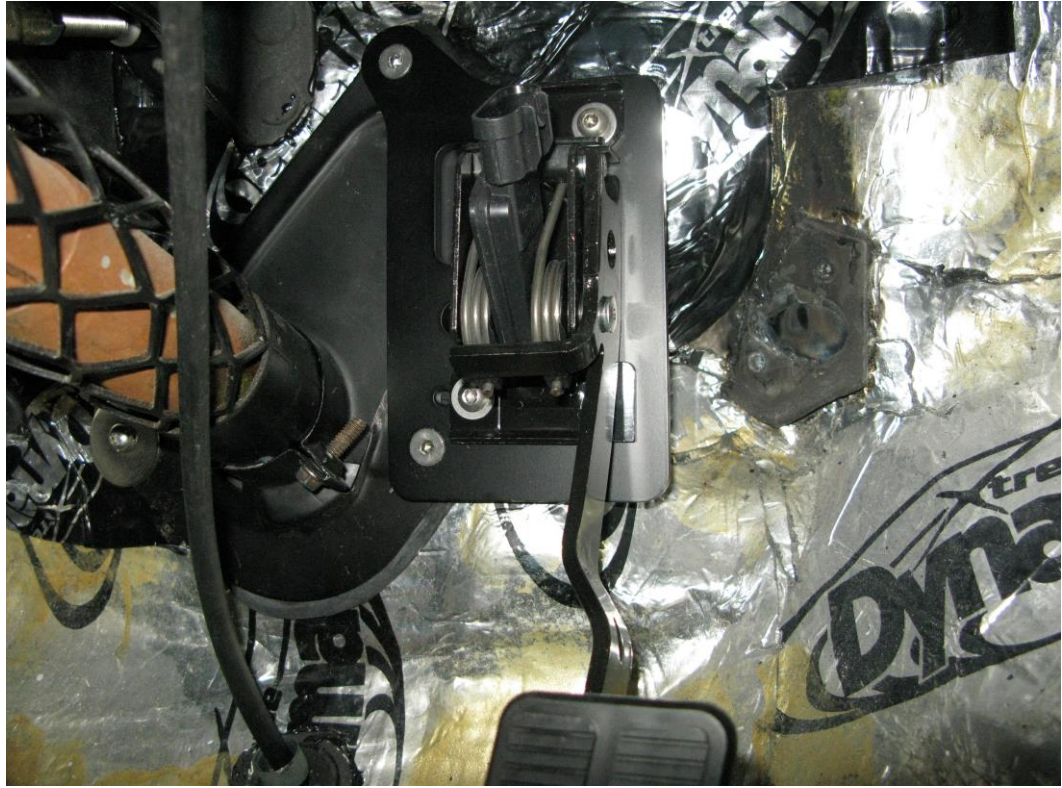
Figure 2 – Installation on a 1967-68 Camaro

Legal Disclaimer: Detroit Speed, Inc. is not liable for personal, property, legal, or financial damages from the use or misuse of any product we sell. The purchaser is solely responsible for the safety and performance of these products. No warranty is expressed or implied.