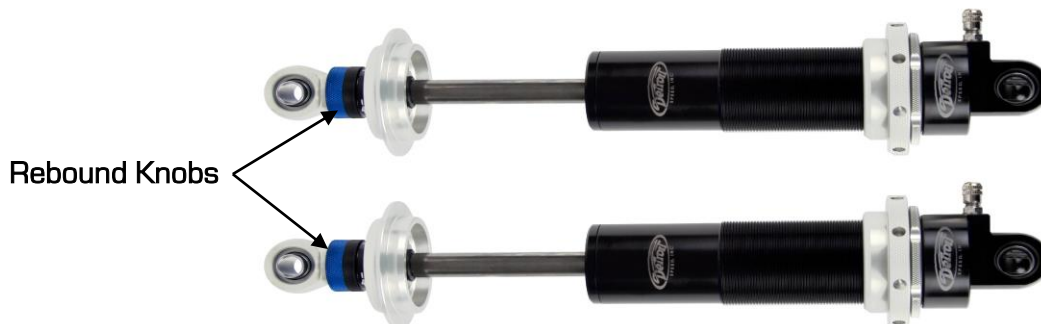
Figure 2a - Detroit Speed Single Adjustable Shock

To change from the recommended “Detroit Tuned” valving, adjustments can be made independently to the rebound setting. The rebound is controlled by the knob at the lower shock mount (Shock is mounted body side up). The knob rotates clockwise (+) to increase the damping and counterclockwise (-) to decrease the damping. Refer to Figure 2a below.