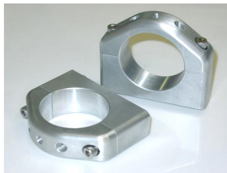
Figure 5 - Billet Aluminum Remote Canister Mounts

To aid in the installation of the reservoirs, we also offer a set of Billet Aluminum Remote Canister Mounts. The canister mounts are available exclusively through Detroit Speed, P/N: 032102 as shown in Figure 5.