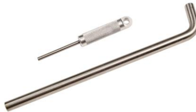
Figure 2 - Spanner Wrench & Adjustment Tool

NOTE: Detroit Speed does include a Spanner Tool (P/N: 031060) to adjust ride height however if you have the adjustable coilover shocks, Detroit Speed does offer an Adjustment Tool available as P/N: 031061 if needed. A photo can be seen in Figure 2.