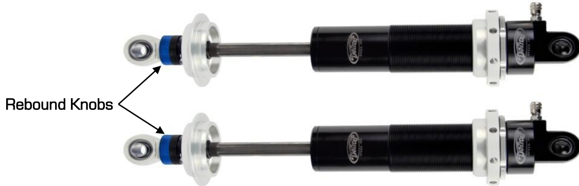
Figure 4- Detroit Speed Single Adjustable Shock

To change from the recommended “Detroit Tuned” valving, adjustments can be made independently to the rebound setting. The rebound is controlled by the knob at the lower shock mount (Shock is mounted body side up). The knob rotates clockwise (+) to increase the damping and counterclockwise (-) to decrease the damping. Refer to Figure 4