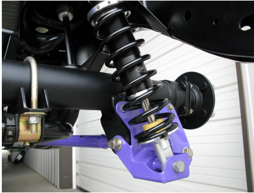
Figure 1 - Lower Coilover Bracket