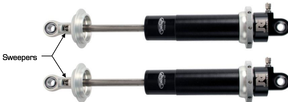
Figure 5 - Detroit Speed Double Adjustable Shock

To change from the recommended “Detroit Tuned” valving, adjustments can be made independently to both the high and low speed settings. The rebound is controlled by the sweepers at the lower shock mount. The sweepers rotate clockwise (+) to increase the damping and counterclockwise (-) to decrease the damping. The sweepers can be seen in Figure 5.