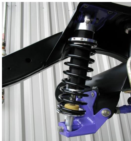
Figure 3 - Completed Installation

31. The installation is now complete. A finished installation can be seen in Figure 3 below. If the upgrade was purchased for the Single Adjustable, Double Adjustable Shocks or the Double Adjustable Shocks w/Remote Canisters, refer to the appropriate sections below for adjustability.