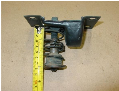
Figure 1 (1967-81 Camaro shown)