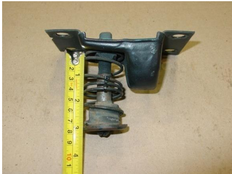
Figure 1 (1967-81 Camaro shown)