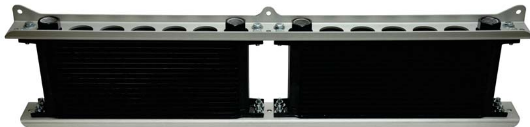
Brackets mounted to 16 Row Stacked Plate Coolers