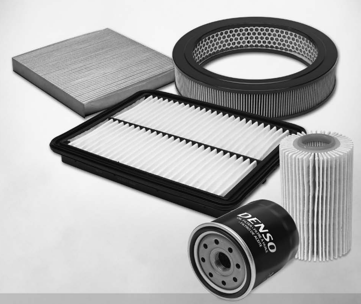
AIR, OIL & CABIN AIR FILTERS

Check out an excellent selection of replacement air intake parts on our website.