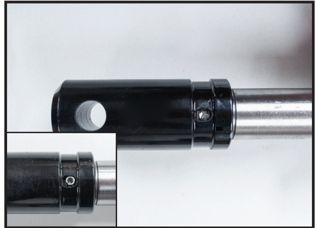
4. Clean the threads and apply some thread lock to threads. Turn on the tabless adapter on shaft until it threads on all the way. Turn off until the hole in shaft lines up with hole in adapter. Drive the new roll pin in hole until flush with adapter.