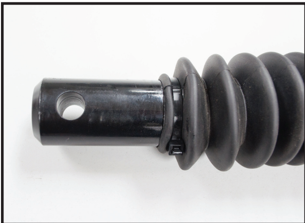
5. With the hole facing up with tow bar, place the rubber boot over adapter and use the supplied plastic tie to clamp boot to adapter. Cut unused plastic tie.