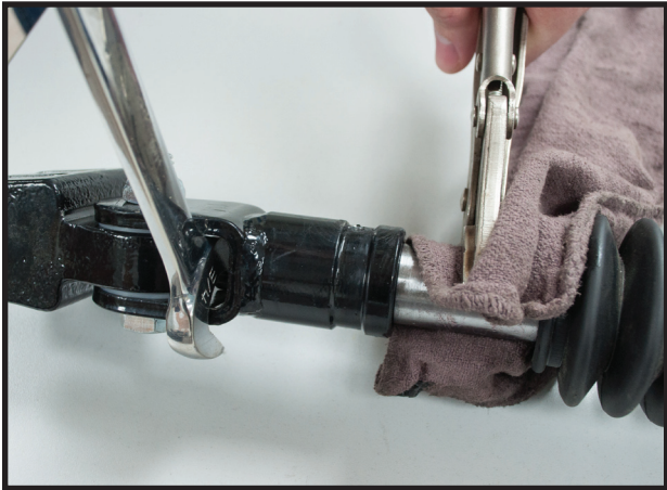
3. Use a vise grip with a rag or bench vise with rag to hold shaft and use a rod or wrench in the clevis to turn off clevis assembly.