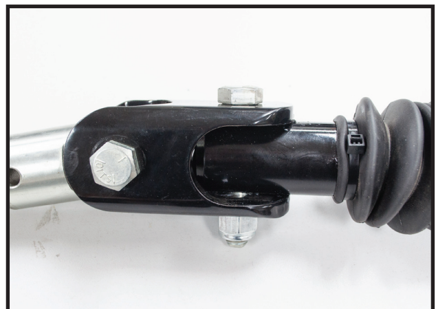
6. Bolt tabless clevis to adapter making sure not to over tighten, the clevis should rotate freely.