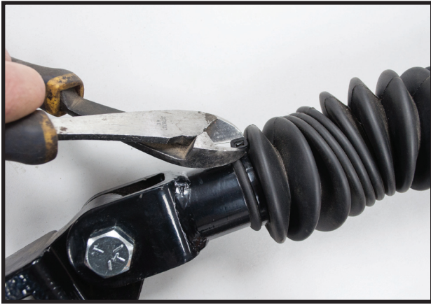
1. Cut plastic tie off of rubber boot on clevis end.