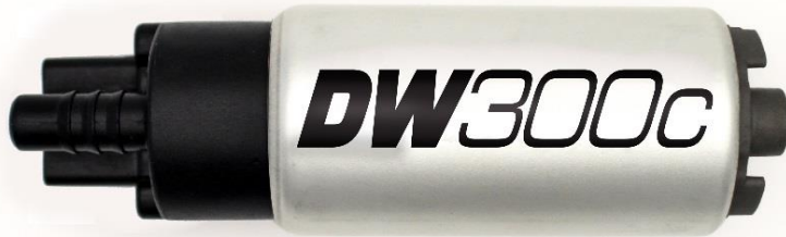
PN 9-307 represented in above photo

The 340lph DW300c offers the highest flow available in a compact fitment pump. The compact fitment allows drop-in fitment into many popular applications such as WRX, R35 GTR, EvoX, CTS-V2, and BRZ/FRS. Quiet operation and pulse width modulation compatibility are delivered via the turbine impeller and computer balanced armature. E85 compatibility is built in via the carbon commutators and a fully encapsulated armature.