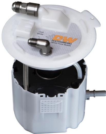
*module shown in return-style configuration

The DW400 5th gen Camaro Module is a complete plug-n-play replacement for the OE unit. The module incorporates the DW400 pump to nearly double the flow output of the OE Camaro SS module and increases pressure capabilities to 120psi. This module also integrates seamlessly with the OE wiring harness, level sender, and feed lines. For those wanting a return-style fuel system, the module is easily convertible to -8AN feed and -6AN return. The module also utilizes a venturi fed surge bucket for consistent fueling at low tank levels and high G conditions.