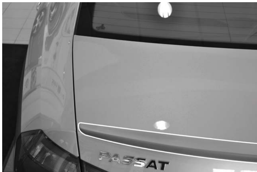
DIAGRAM B: Outline spoiler with a grease pencil