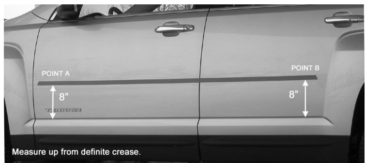
2010 & Up GMC Terrain