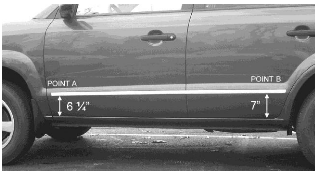
Model Year 2007 - 2009

AFTER THE MOLDING has been installed, use a soft cloth and apply pressure along the entire length of the molding to insure proper adhesion. Remove masking tape and you will have an OEM style Custom Body Side Molding that will give you many years of protection.