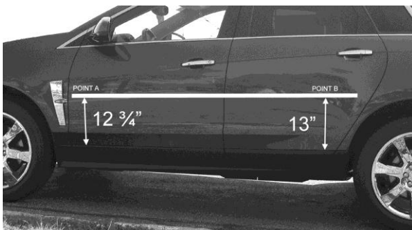
Cadillac SRX • Measure up from top of cladding

AFTER THE MOLDING has been installed, use a soft cloth and apply pressure along the entire length of the molding to insure proper adhesion. Remove masking tape and you will have an OEM style Custom Body Side Molding that will give you many years of protection.