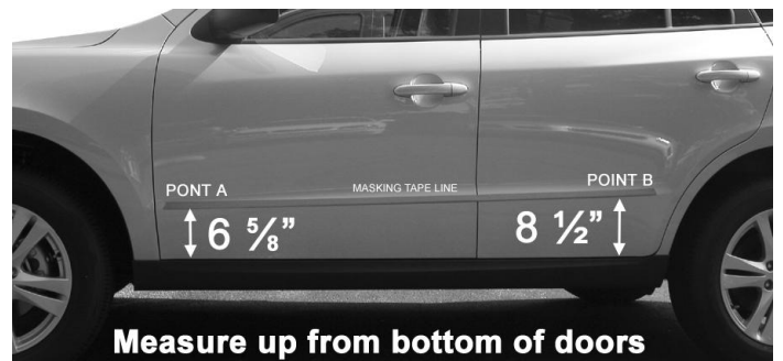
Measure up from bottom of doors