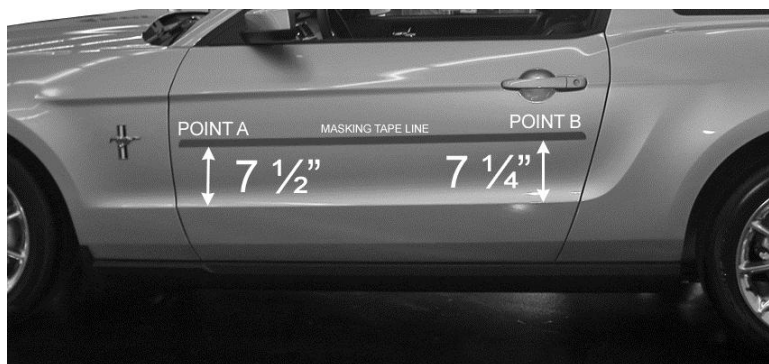
Measure up from definite crease

AFTER THE MOLDING has been installed, use a soft cloth and apply pressure along the entire length of the molding to insure proper adhesion. Remove masking tape and you will have an OEM style Custom Body Side Molding that will give you many years of protection.