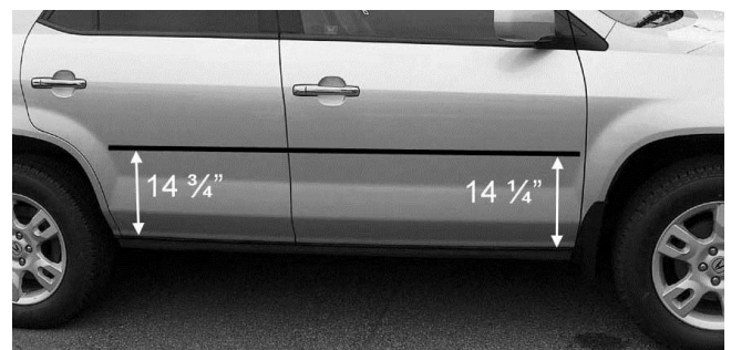
2001 – 2007 Model

IMPORTANT! When installing the Rear Door Molding with the bevel cut , start the molding approximately ¼” from the edge of where the rear door starts. When installing the Front Door Molding with the straight cut , start molding approximately 1/8” from where the edge of the door starts.