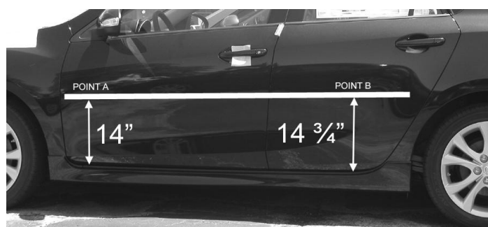
2010 & Up Mazda 3 • 5 Door