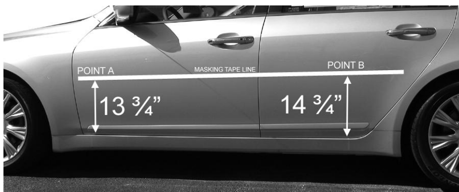
Measure up from bottom of doors

AFTER THE MOLDING has been installed, use a soft cloth and apply pressure along the entire length of the molding to insure proper adhesion. Remove masking tape and you will have an OEM style Custom Body Side Molding that will give you many years of protection.