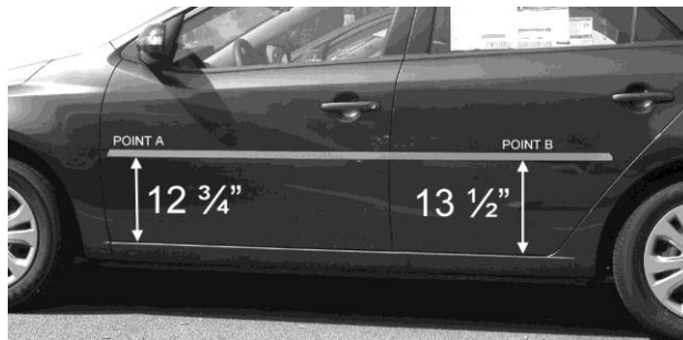
Measure up from bottom of door

AFTER THE MOLDING has been installed, use a soft cloth and apply pressure along the entire length of the molding to insure proper adhesion. Remove masking tape and you will have an OEM style Custom Body Side Molding that will give you many years of protection.