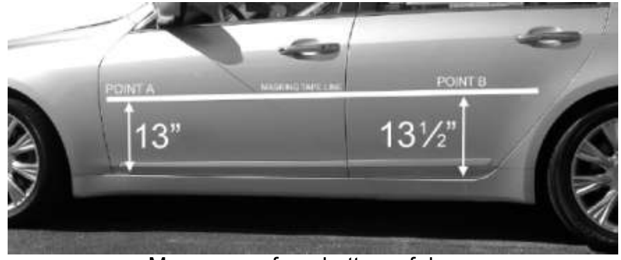
Measure up from bottom of doors

<u>AFTER THE MOLDING</u> has been installed, use a soft cloth and apply pressure along the entire length of the molding to insure proper adhesion. Remove masking tape and you will have an OEM style Custom Body Side Molding that will give you many years of protection.