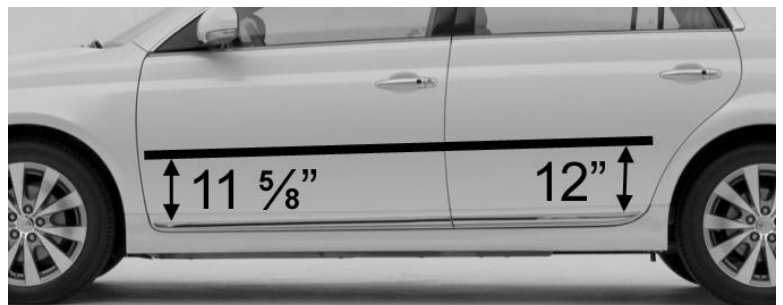
2011+ Measure up from top of chrome