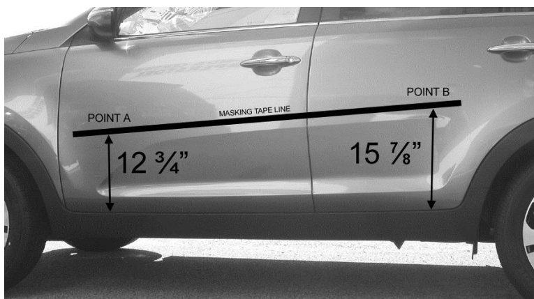
Measure up from bottom of doors

AFTER THE MOLDING has been installed, use a soft cloth and apply pressure along the entire length of the molding to insure proper adhesion. Remove masking tape and you will have an OEM style Custom Body Side Molding that will give you many years of protection.