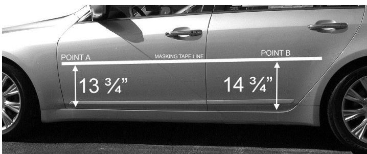
2009-2014 Hyundai Genesis

AFTER THE MOLDING has been installed, use a soft cloth and apply pressure along the entire length of the molding to insure proper adhesion. Remove masking tape and you will have an OEM style Custom Body Side Molding that will give you many years of protection.