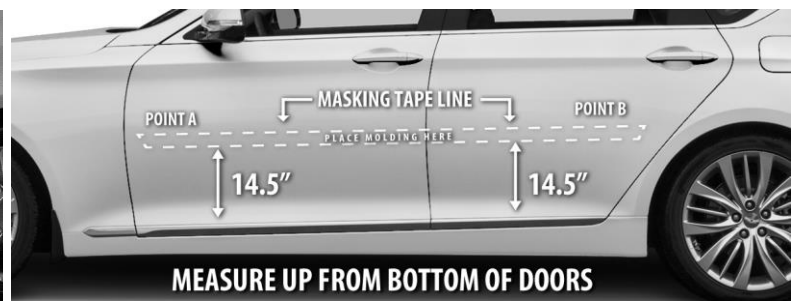
2015 Hyundai Genesis