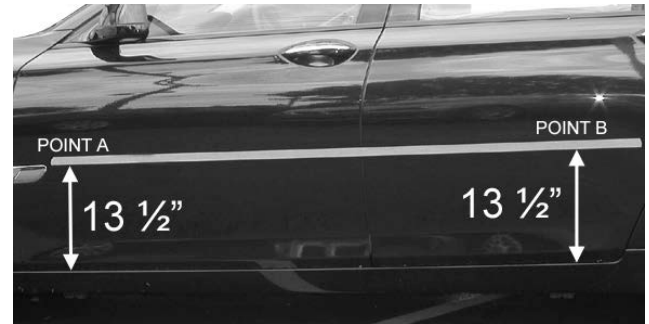
2009+ BMW 7 Series