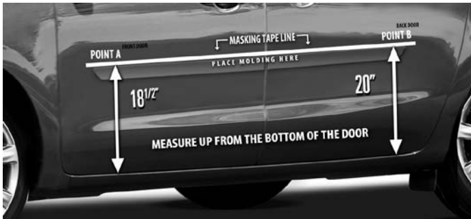
2015+ Kia Sedona