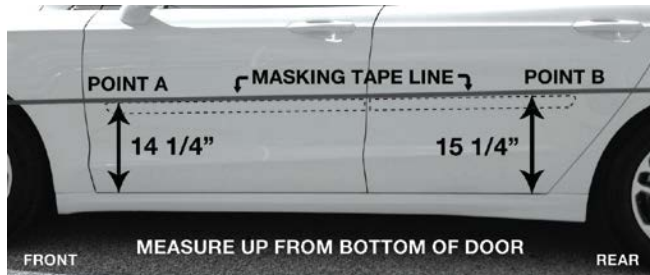
2013+ Ford Fusion