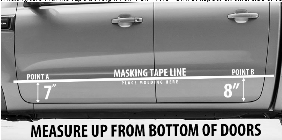
*The Super Crew Cab is shown in the above image, however, these measurements also apply to the Super Cab Models!

Run masking tape as seen in the diagram below from POINT A to POINT B. Press tape against the vehicle, making sure that the tape is straight from POINT A to POINT B. Repeat on other side of vehicle.