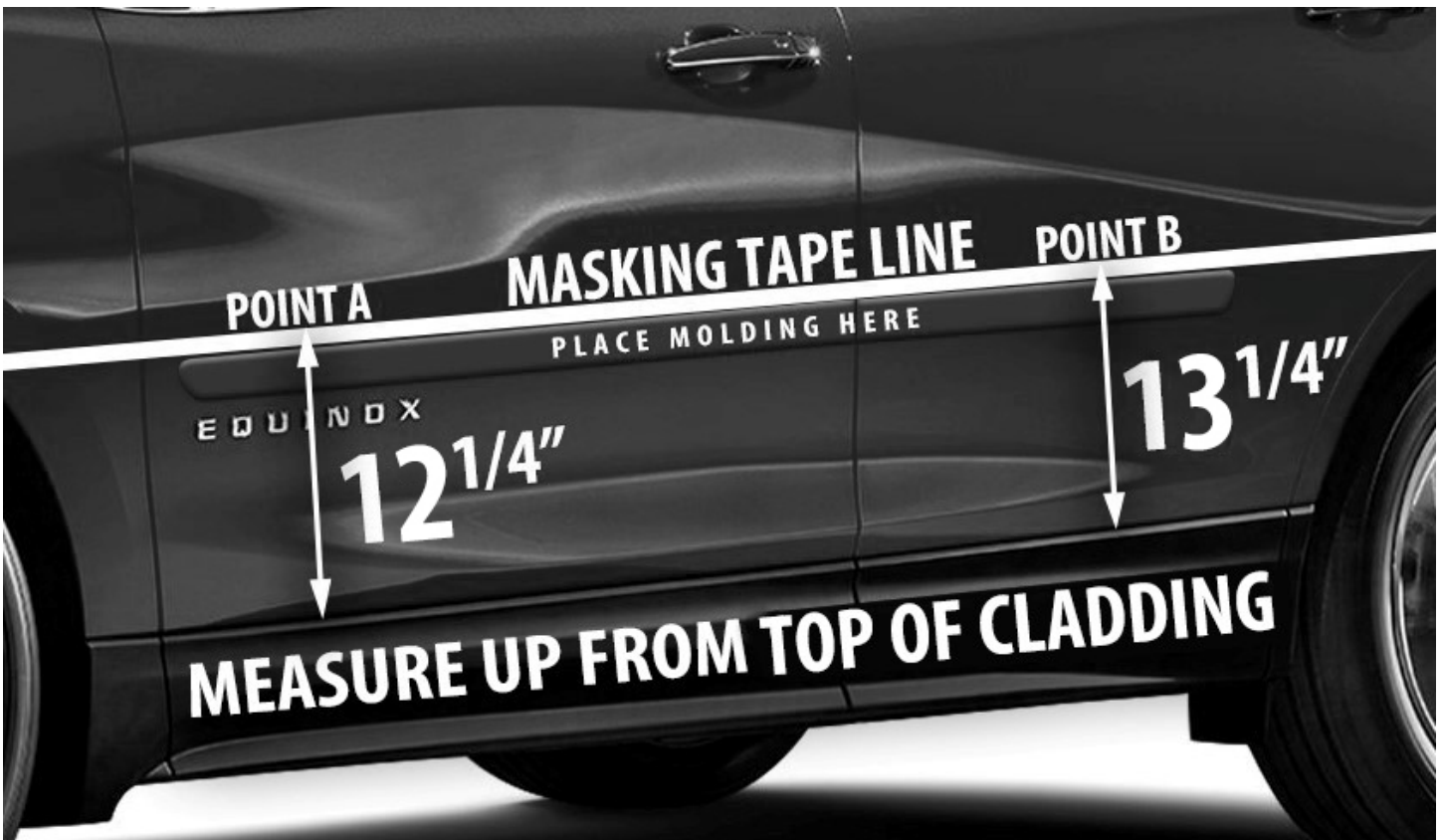
2018+ Chevrolet Equinox