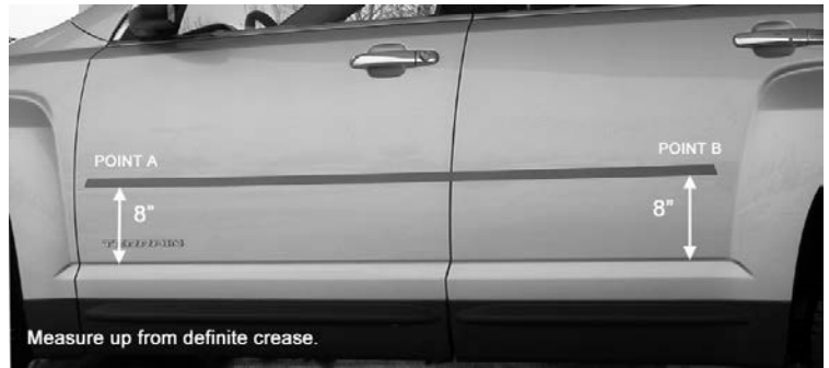
2010 & Up GMC Terrain