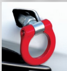
FOLDS TO 90°