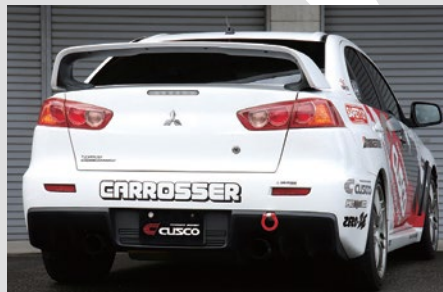
Lancer Evo X (CZ4A) Rear Tow Hook