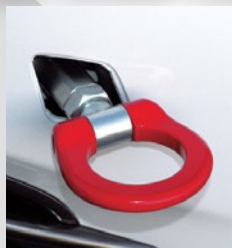
SWIVELS TO 180°