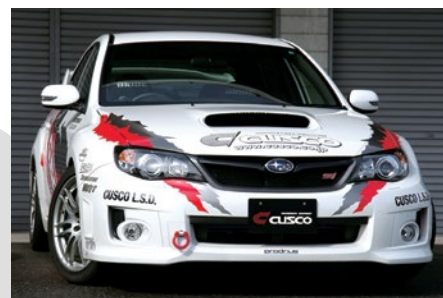
Impreza (GVB) Front Tow Hook