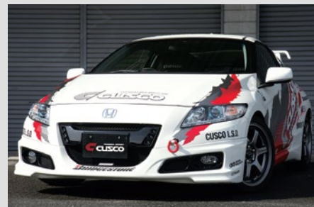
CR-Z (ZF1) Front Tow Hook