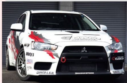
Lancer Evo X (CZ4A) Front Tow Hook