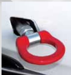
SWIVELS TO 180°