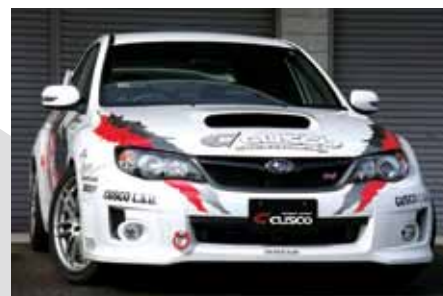
Impreza (GVB) Front Tow Hook