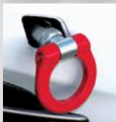
FOLDS TO 90°