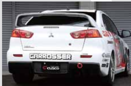
Lancer Evo X (CZ4A) Rear Tow Hook