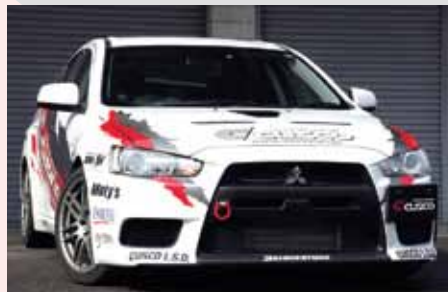
Lancer Evo X (CZ4A) Front Tow Hook