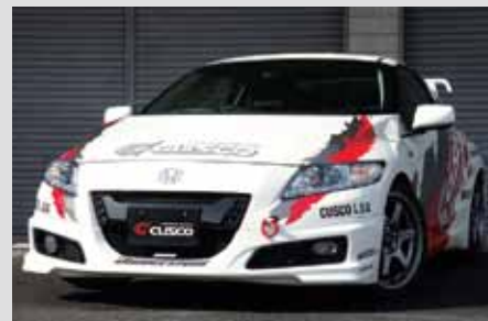
CR-Z (ZF1) Front Tow Hook