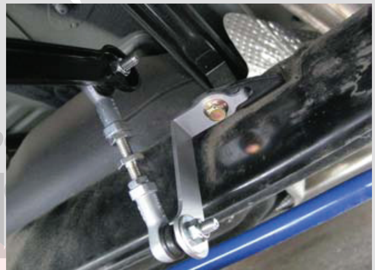
HA = Short Rod + H Bracket Installed (ZVW30 PRIUS)

To counter this issue, CUSCO has engineered the AUTO LEVELIZER to enable the re-setting of the correct headlight trajectory. In some cases, the ECU can be reset to readjust the headlights according to its vehicle height; however there are parameter limitations for electronic sensors which will eventually require a mechanical approach to the solution.