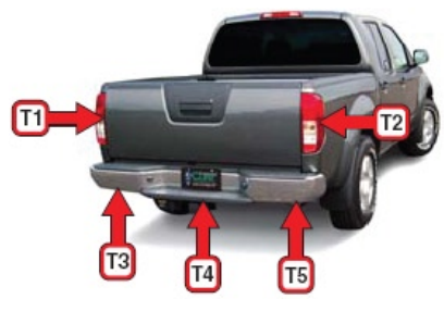
MUST READ FIRST! All steps must be followed to ensure correct function of the T-Connector. To verify proper installation once installed, test by connecting a test light or properly wired trailer.

1. Locate the vehicles factory OEM trailer light wiring harness. The harness will be connected to the vehicle's 7-way trailer connector which is mounted to hitch or bumper at the rear of the vehicle. The harness will have a connector similar to the paired connectors on the extension harness.