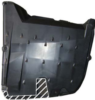
TRIM UNDERBODY PANEL TRIM DIAGRAM