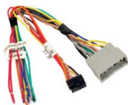
1st Generation Harness