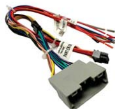
2nd Generation Harness