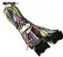
14 & 16 Pin Harness