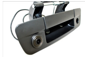
Tailgate Handle Camera