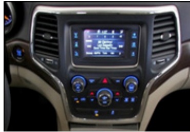
5" Screen with 6 Buttons & Separate Knobs