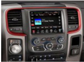
8.4" Screen with Separate Knobs