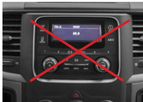
4.3" Screen with 4 Buttons & 2 Knobs