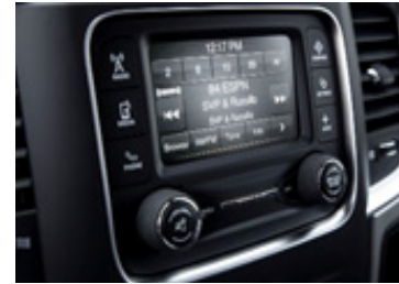
4.3" Screen with 6 Buttons & 2 Knobs